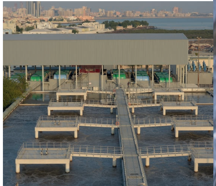
The compact SMART™ units are in the background.

The HYBACS® Upgrade at Tubli WPC has more than doubled the capacity of existing aeration lanes.